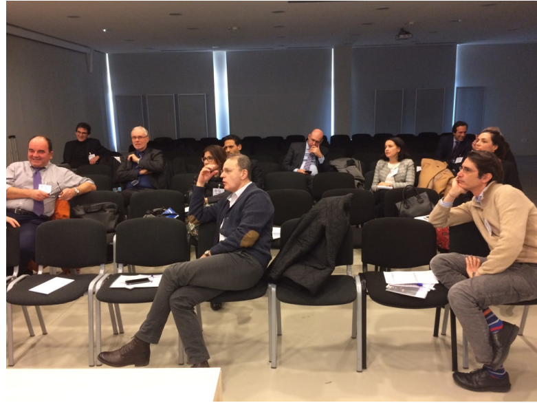
CW Start-up Meeting in Milan