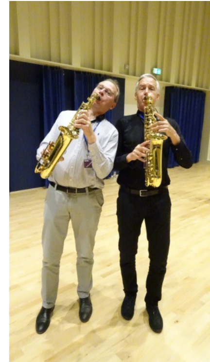
Multidisciplinary work in harmony