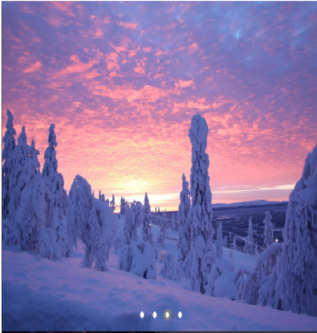
Kittilä in Januari