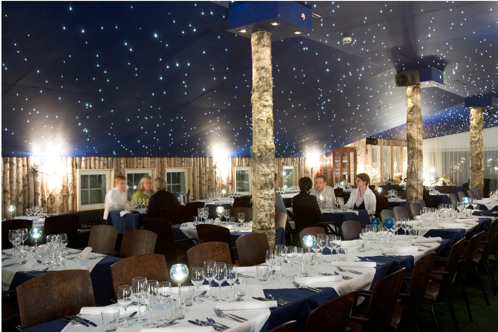
Sky restaurant at 4th floor...